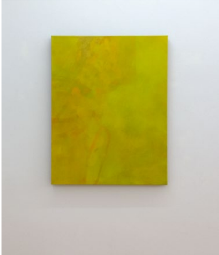
(120107) © 2012, 90 x 70 cm pigment, wax and dammar on linen