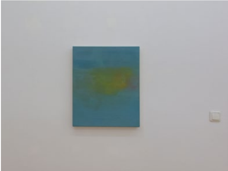
(110105) © 2011, 60 x 50 cm pigment, wax and dammar on canvas