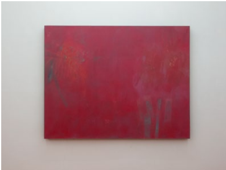
(120109) © 2012, 110 x 140 cm pigment, wax and dammar on linen