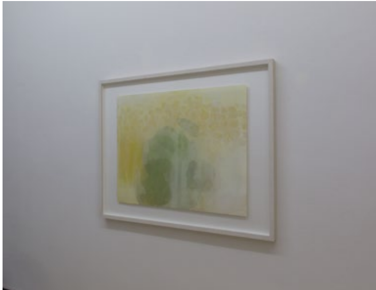
study © 2012. 35 x 25 cm pigment, wax and dammar on arches mold made, 100% cotton, 300g paper