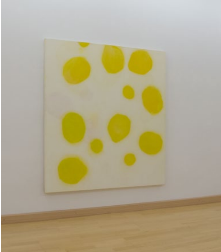
(110105) © 2011, 60 x 50 cm pigment, wax and dammar on canvas