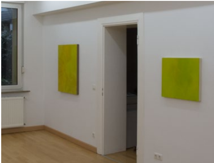
(120107) © 2012, 90 x 70 cm pigment, wax and dammar on linen (110102) © 2012, 50 x 60 cm Pigment, wax and dammar on canvas