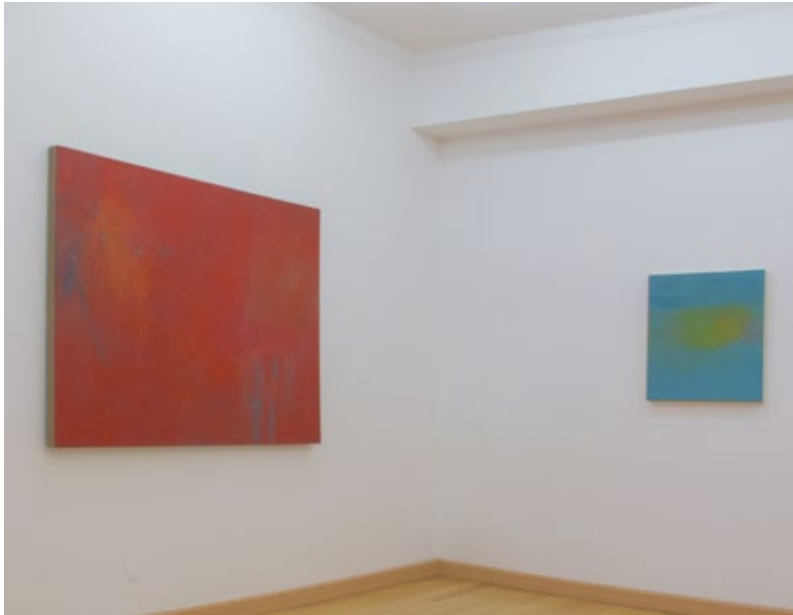
(120109) © 2012, 110 x 140 cm pigment, wax and dammar on linen (110105) © 2011, 60 x 50 cm pigment, wax and dammar on canvas