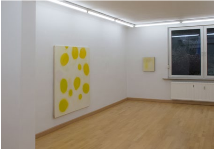
(110105) © 2011, 60 x 50 cm pigment, wax and dammar on canvas (120106) © 2012, 70 x 90 cm Pigment, wax and dammar on linen