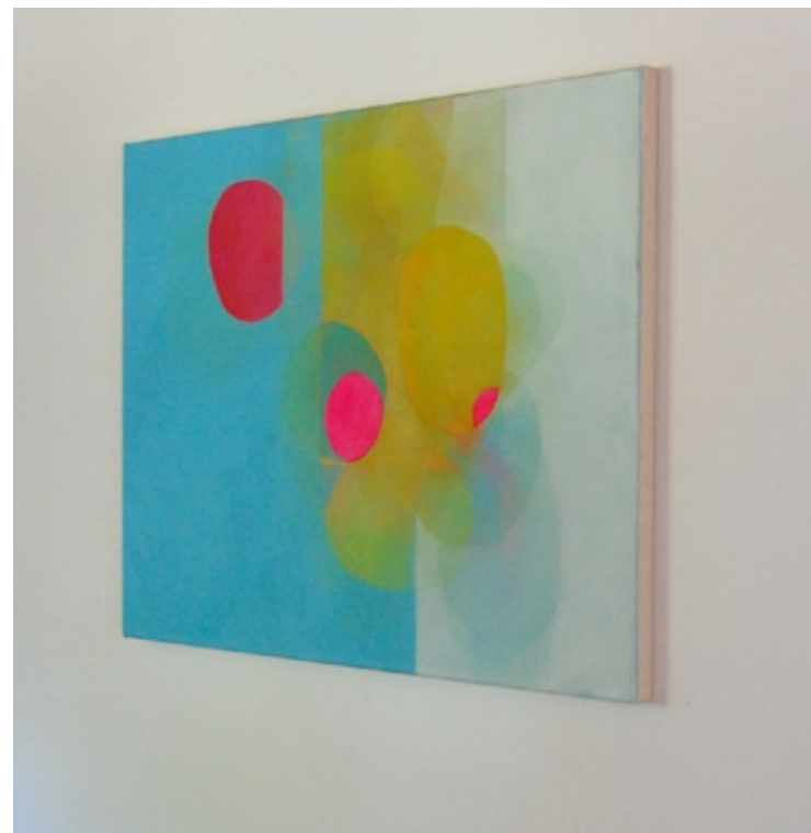
installation view first floor untitled(070212) ©2007, 100 cm x 130 cm pigment, wax and dammar varnish on canvas