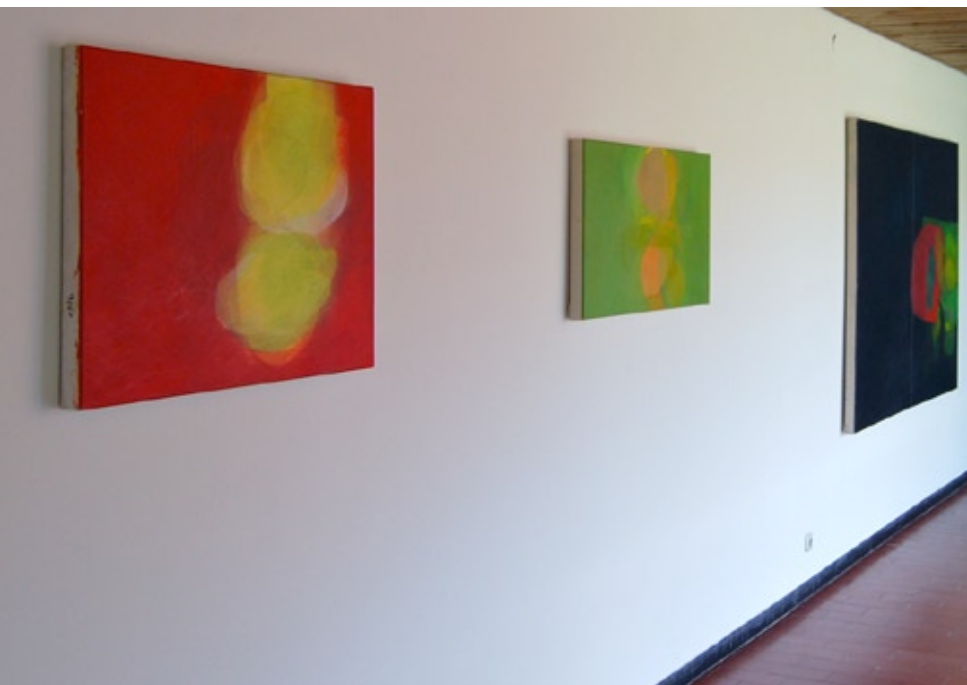
installation view ground floor last week things were said (090116) ©2009, 60 cm x 80 cm we sat and looked out over the orchard (100102) ©2010, 50 cm x 90 cm Ryder called late that evening (090109) ©2009, 140 cm x 200 cm Pigment, wax and dammar varnish on canvas