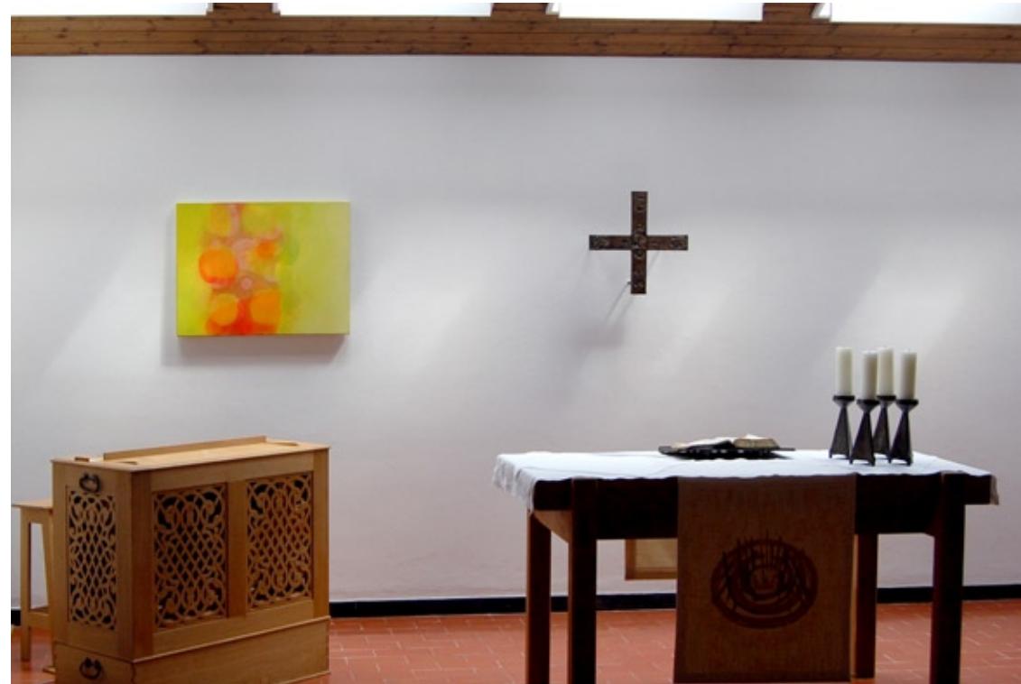
installation view chapel simple tasks seemd to get harder (090117) ©2009, 60 cm x 80 cm pigment, wax and dammar varnish on canvas