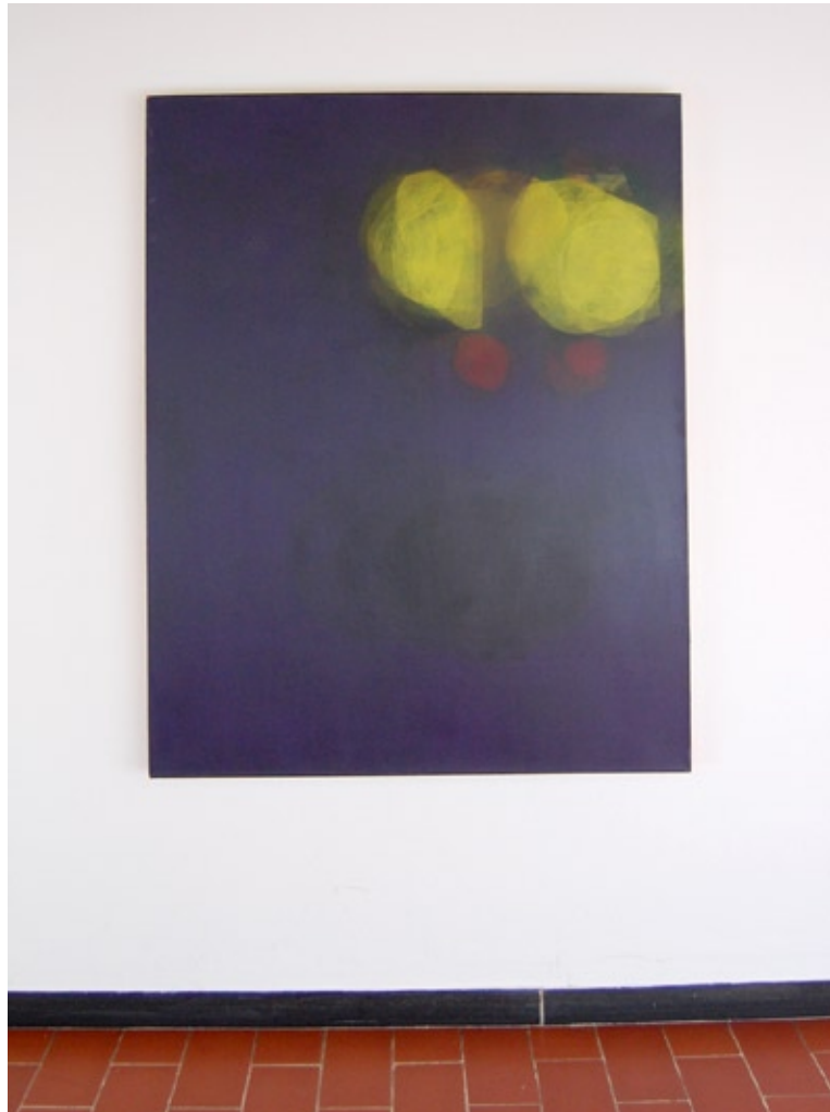
installation view first floor she could come home any time (090115) ©2009, 140 cm x 100 cm pigment, wax and dammar varnish on canvas