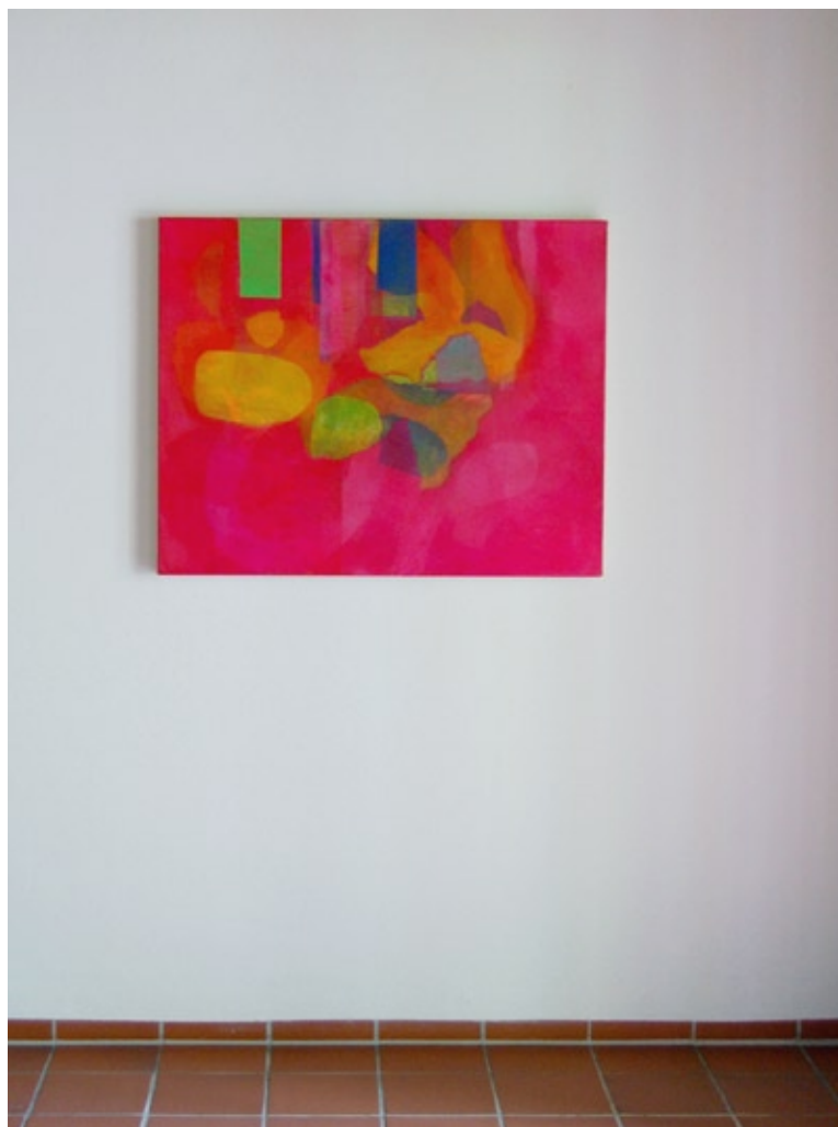
installation view first floor three afternoons waiting in town (080110) ©2008, 80 cm x 100 cm pigment, wax and dammar varnish on canvas