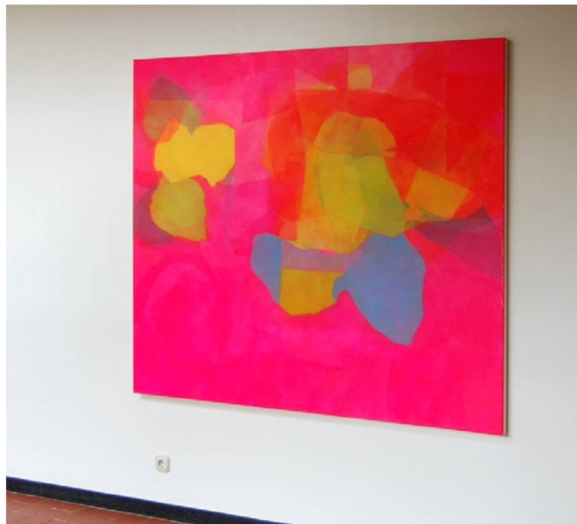
installation view ground floor waiting outside in the evening (080118) ©2008, 160 cm x 180cm pigment, wax and dammar varnish on canvas